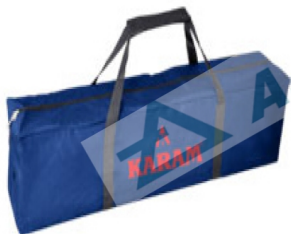
TRIPOD BAG PN 904 (7ft) (BL)