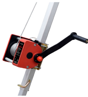
WINCH PN 801 (DP)