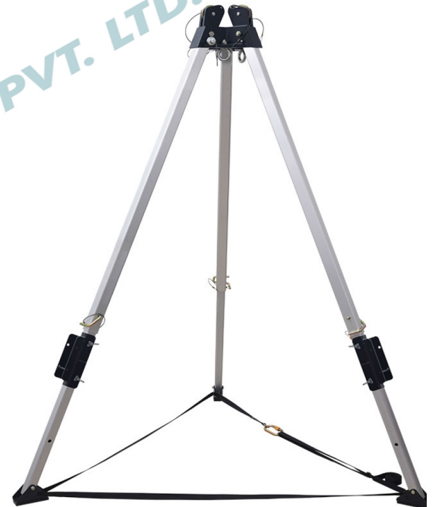
TRIPOD PN 800 (DP) (7ft)