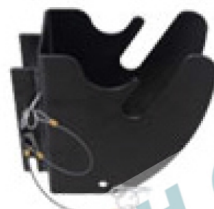
MOUNTING BRACKET PN 800 (45) For Installing PCGS 20R On PN 800 (DP) (7ft)