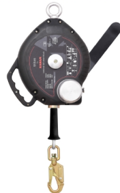
RETRIVAL FALL ARRESTOR BLOCK PCGS 20R (N)