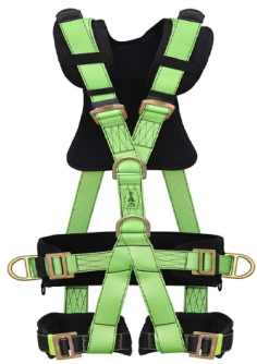
TOWER HARNESS PN 56